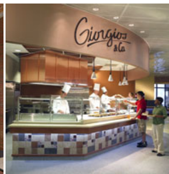
Design & Construction

Porter Khouw Consulting, Inc. P.O. Box 4028 1672 Village Green Crofton, MD 21114