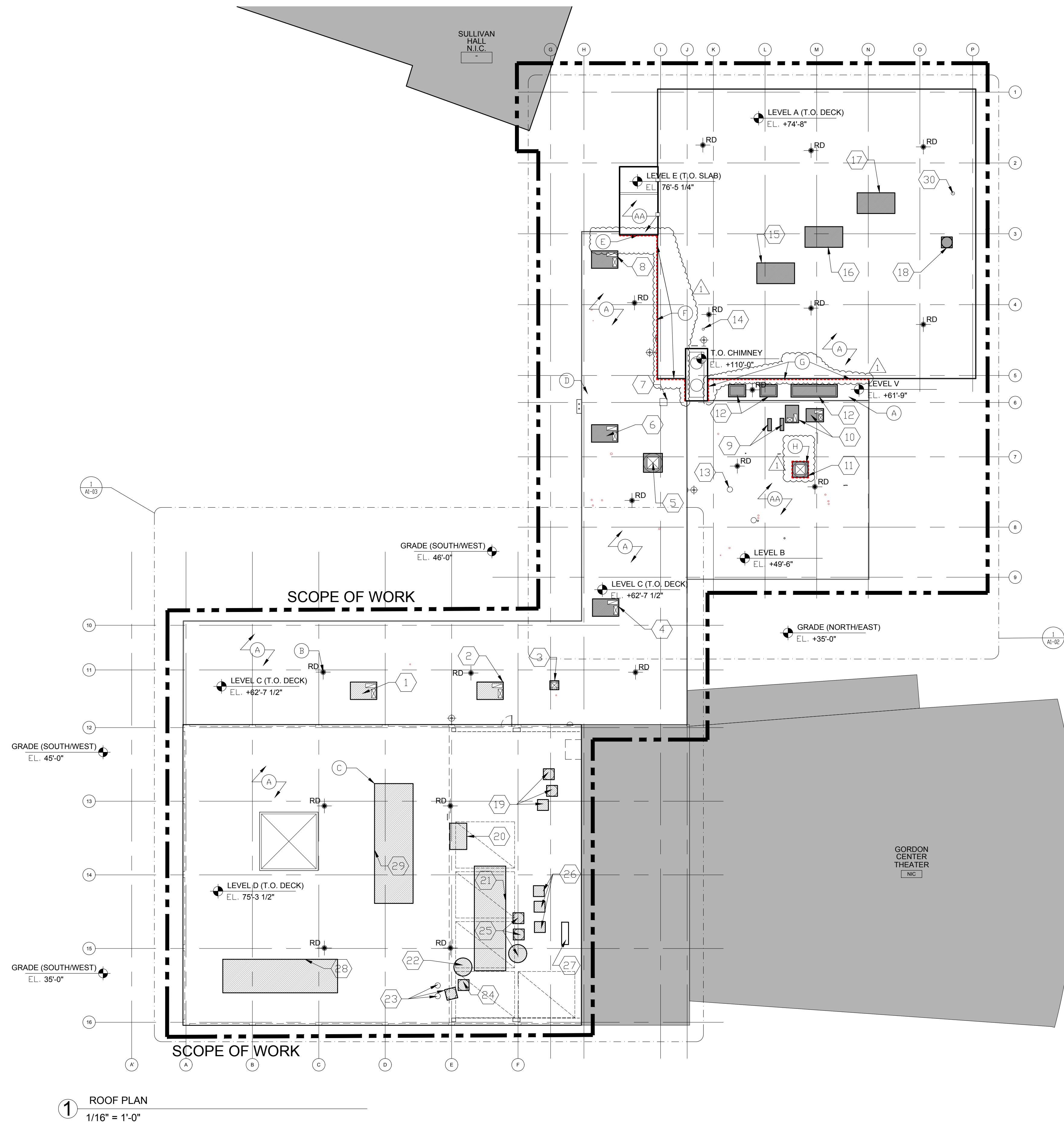
1 ROOF PLAN 1/16" = 1'-0"

*REFER TO ASBESTOS ABATEMENT SPECIFICATIONS AND REPORT FOR ADDITIONAL INFORMATION REGARDING REMOVAL OF HAZARDOUS MATERIALS